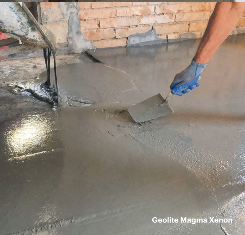
Geolite Magma Xenon